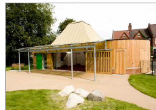
Outdoor space free of rubbish, decorations and all other brought in equipment