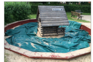
Sandpit should be covered free of rubbish