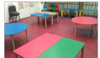
Main play room. Tables and chairs wiped and reorganized. Clean floor and room free of decorations.